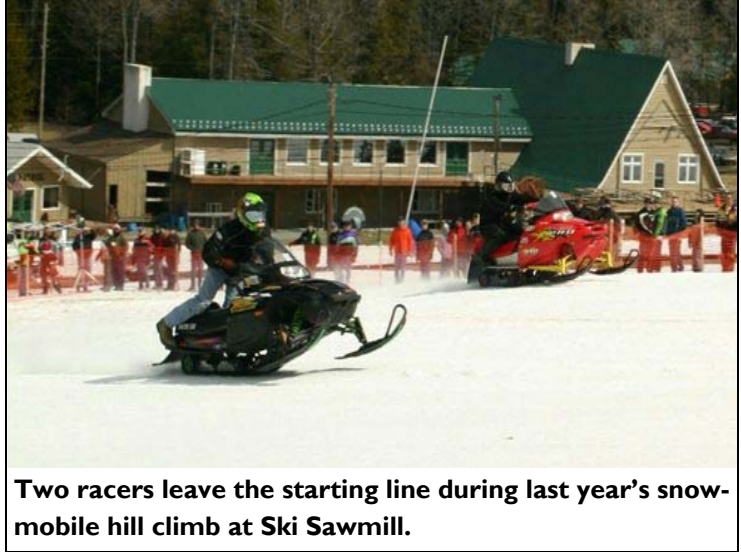
Two racers leave the starting line during last year’s snowmobile hill climb at Ski Sawmill.

There will be numerous classes based on engine size for this head-to-head, double elimination race to the top of the hill. New safety rules will be in place for this year, so if you plan to compete, be sure to review those rules as soon as possible as they may require mechanical modifications to your sled.