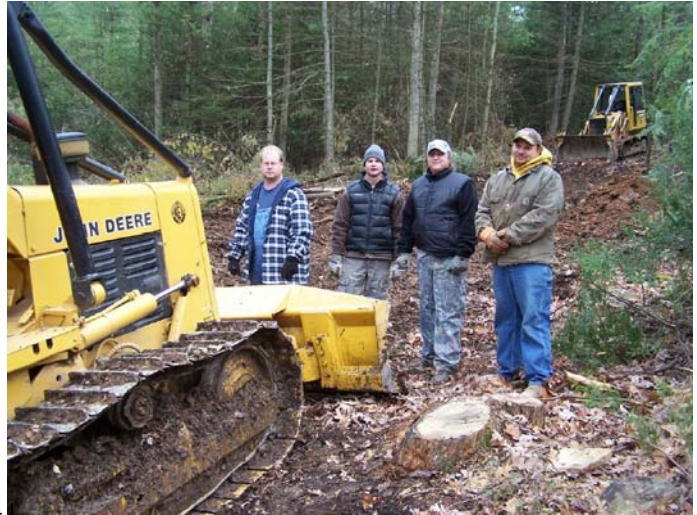
Club members take a short break during workday

Thanks again to you and club members for a good job.