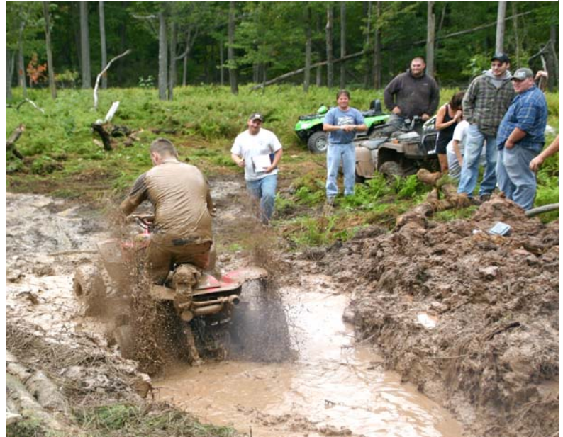
A “Mudbogger” sashes his way through during Summerfest

You can see more pictures from Summerfest at www.highlandlakeoutdoorrecreationclub.com .